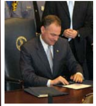
Virginia Governor Tim Kaine (Convened Virginia's Commission on Sexual Violence)

"[These frameworks can] empower the next wave of researchers and practitioners to invent effective 'big-picture' strategies for preventing sexual violence and intimate partner violence."