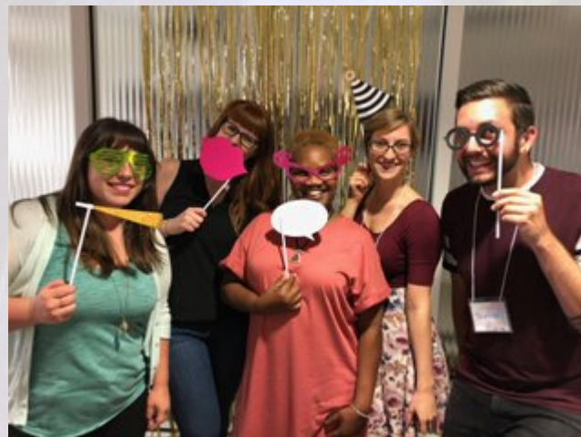
Staff at our 2018 Youth Summit.

We hosted our Justice. Healing. Liberation. conference on May 2-4 in Glen Allen, Virginia. In attendance were 140 advocates, law enforcement professionals, preventionists, attorneys, case managers, and more! We held 32 workshops presented by over 40 presenters, a panel of 5 incredible storytellers, and 3 inspiring keynotes. Our conference included daily yoga sessions, two passionate performances by the Latin Ballet of Virginia, and a fundraising paint night hosted by Lynn Black from Paint for Good.