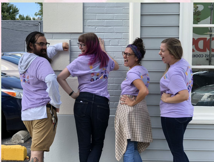
MSW students at a 2018 (em)Power Challenge event.

Our members and staff supported the March for Black Women, for the second year, with a contribution to Black Women's Blueprint and through our participation in the march. The Action Alliance was also part of the national walk-out in support of Dr. Ford during the Kavanaugh hearings. Additionally, we hosted our first Youth Summit and participated in the youth Justice Parade organized by RISE for Youth in support of non-carceral alternatives for youth.