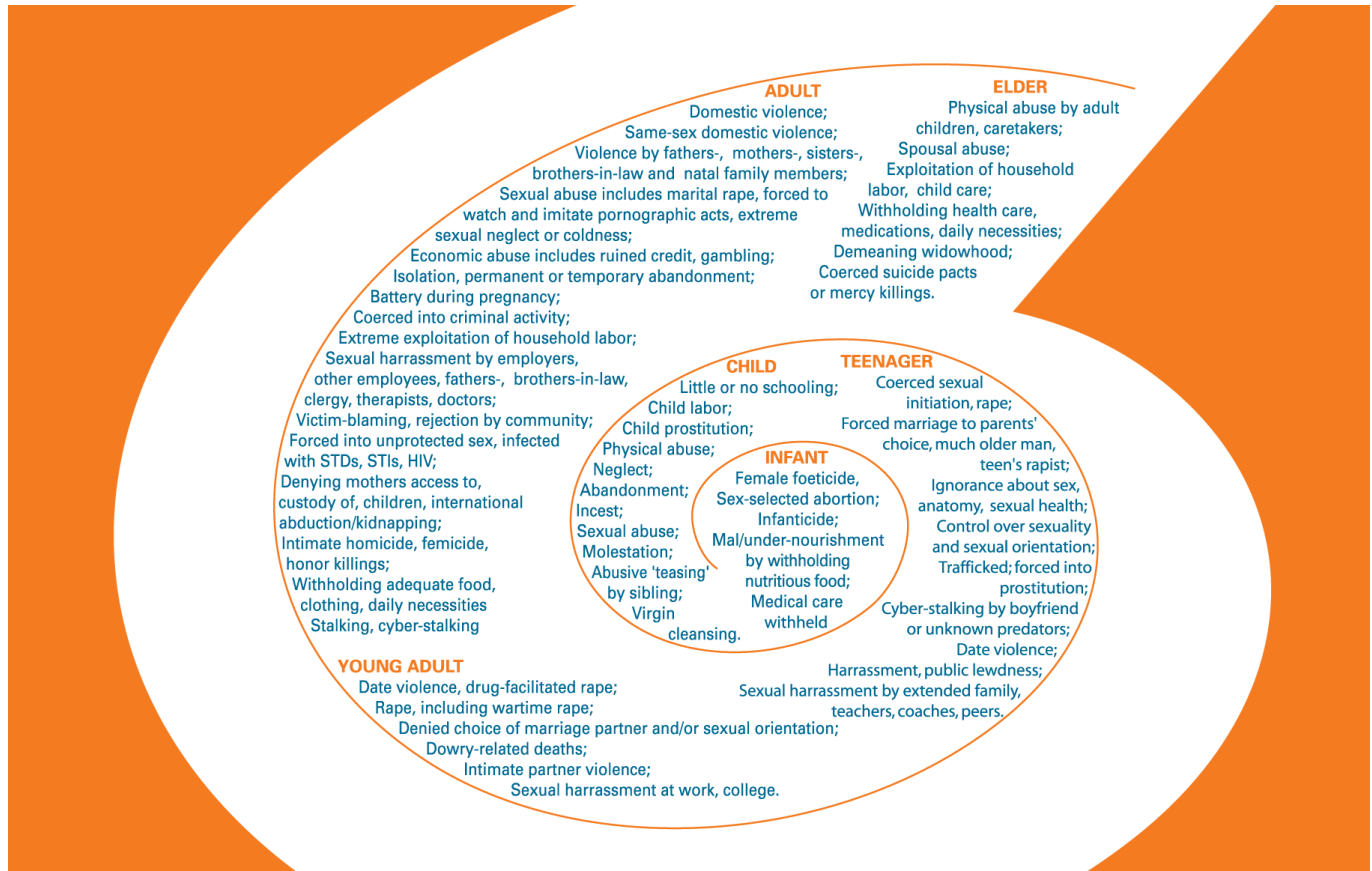
Translated versions of the Lifetime Spiral in Chinese, Farsi, Korean, Punjabi, Tagalog and Vietnamese available at www.apiidv.org . January 2002. Revised 2010.

From the aborting of female fetuses to intimate homicide, girls and women may encounter numerous oppressions during infancy, childhood, adolescence, adulthood, and as elders. Some of these are confined to one stage in the lifecycle, some continue into subsequent stages.