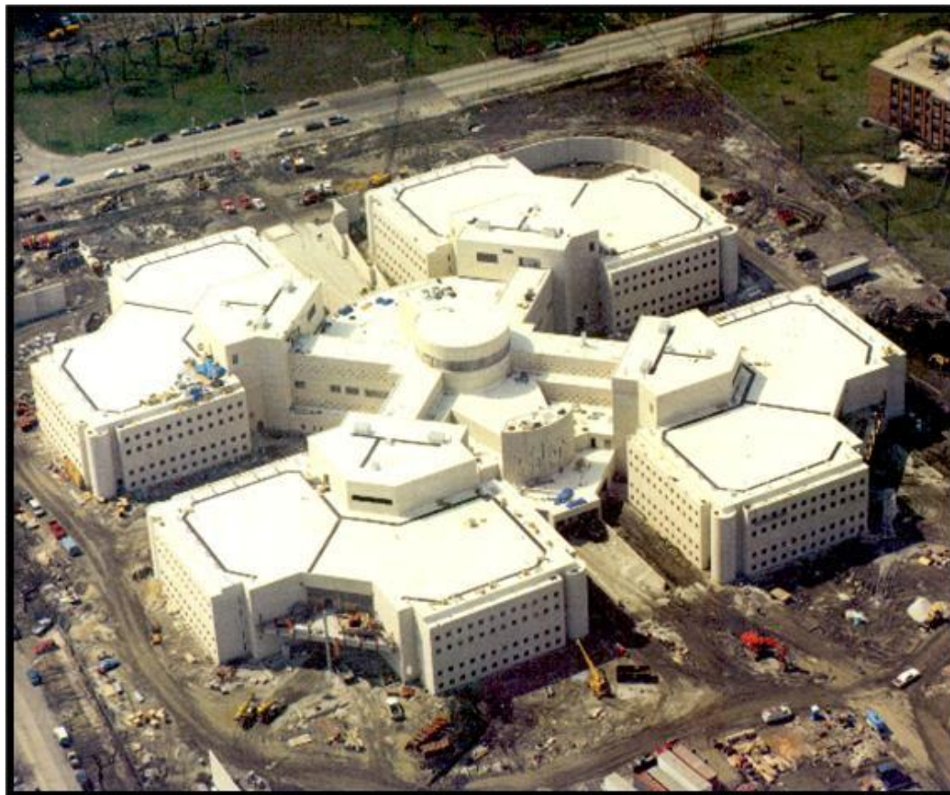
Cook County Jail, Chicago, IL