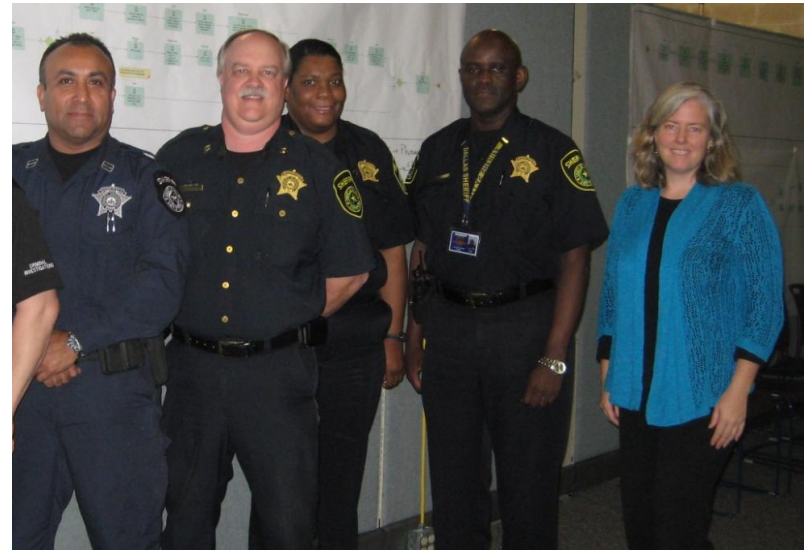
JDI and Dallas County Sheriff's Office staff.