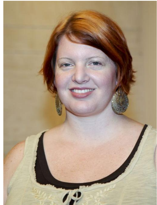
Hope, survivor of sexual abuse in a jail