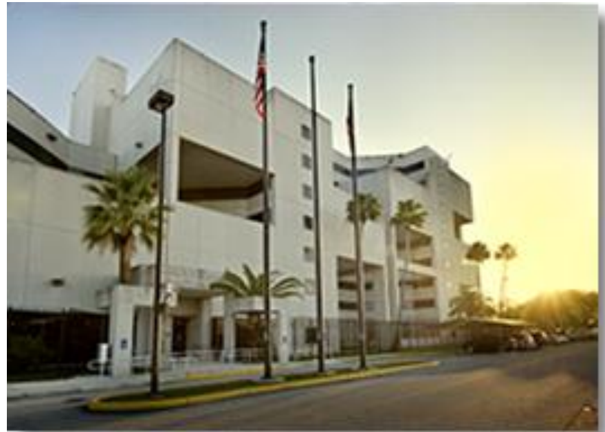
Turner Guilford Knight Correctional Center, FL