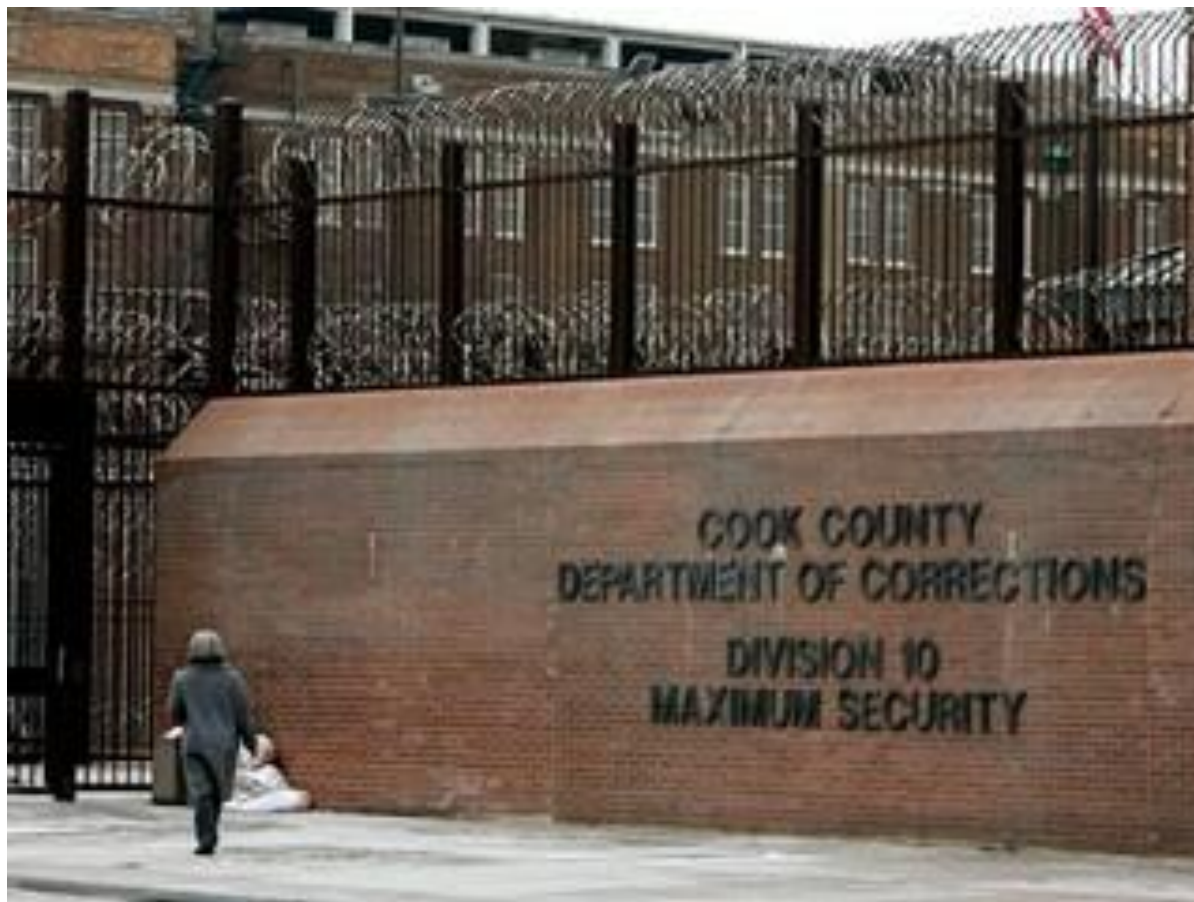
Cook County Jail, Chicago, IL